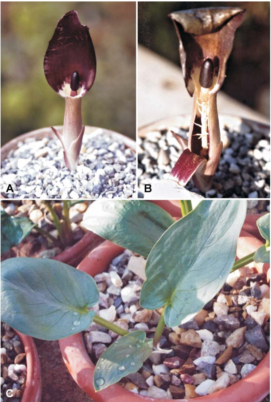
Fig. 2. Eminium jaegeri – A: flowering in cultivation, note the apex of the spathe still being erect; B: inflorescence, tube of spathe opened to show the sterile flowers between the female and male flowers; C: cultivated plant with leaves.